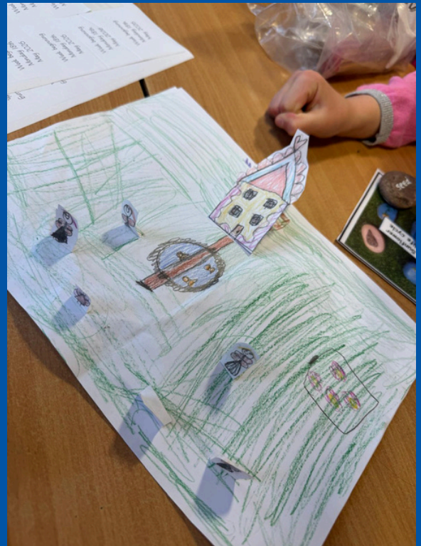
Art inspired by the garden by Alice and Skye in RB