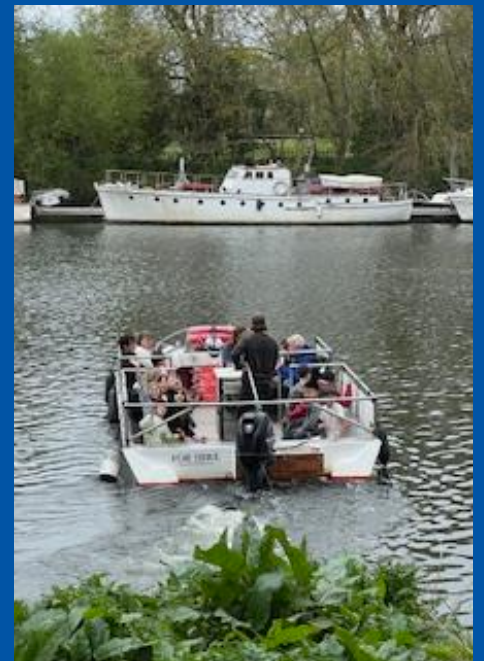
The ferry home!