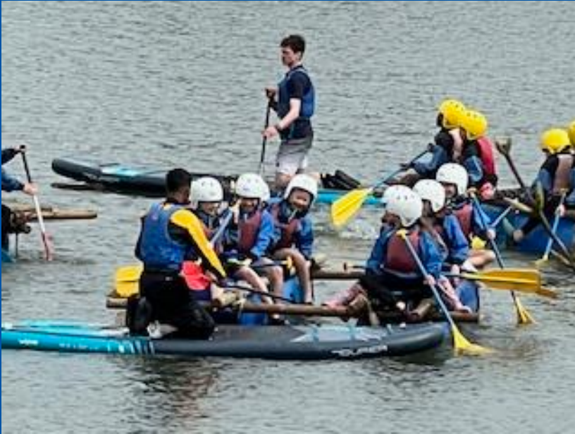
Testing the rafts!