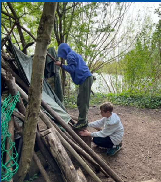
Collaborative den building