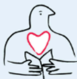
Choose a poem